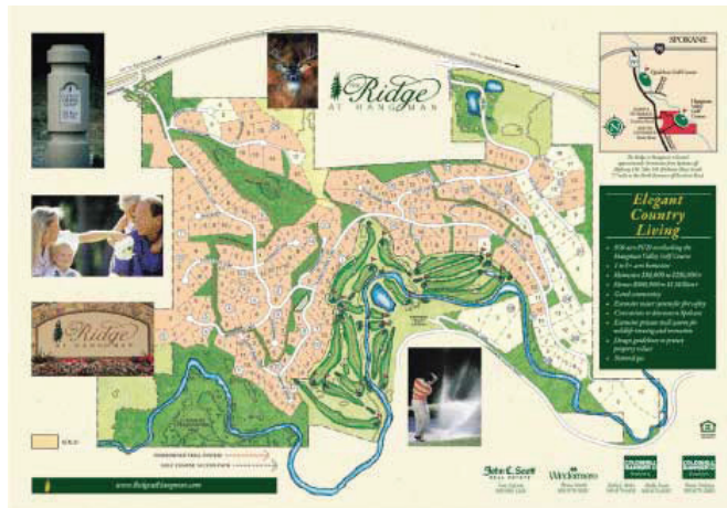
The Ridge at Hangman, Spokane, Washington. A 930 acre residential development overlooking the Hangman Valley golf course.

Seaboard is recognized as a real estate development firm with a commitment to creating sensitively designed single-family residential communities that preserve the natural surroundings, while providing homeowners with a distinctive and preferred lifestyle. The firm has received numerous civic, historic preservation and national design and recognition awards. The firm is headquartered in Sun Valley, Idaho.