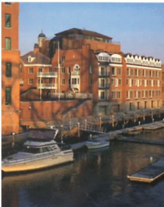
Residences at Harbour Place, Portsmouth, New Hampshire. Luxury residences overlooking the harbor as part of a 140,000 square foot mixed-use development.