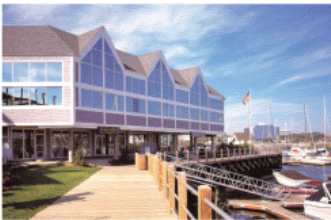
Stamford Landing, Stamford, Connecticut. Project consists of 200,000 square feet of office space, two restaurants, retail space and 130 boat slips.